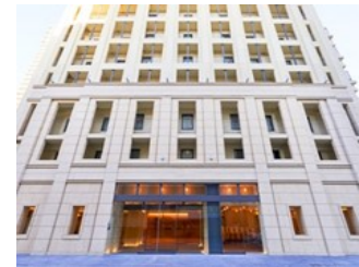
Hotel Meriken Port Kobe Motomachi