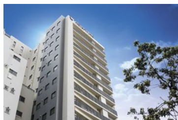
Hotel Wing International Select Ueno/Okachimachi (Owned by MIRAI)