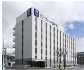
Comfort Hotel Kitakami (Owned by MIRAI)